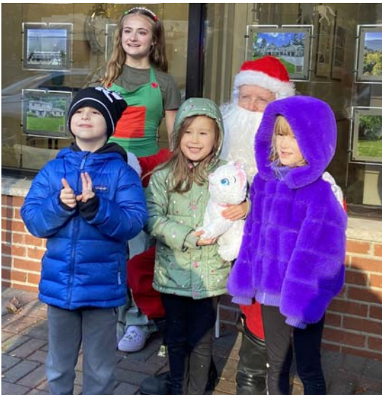
The Briarcliff Manor Fire Department brought Santa and his sleigh – aka a fire truck with flashing lights – to spread holiday cheer.

Thank you to everyone who participated. Whether you attended the luncheon, bought raffle tickets, or did your holiday shopping at the participating shops, your generosity and involvement have made a significant impact, and we couldn’t have done it without you. See you next year!