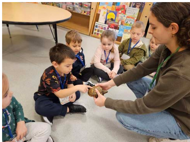
Teatown Turtle Visits OCC: Our four-year-olds are fascinated by their freshwater reptilian visitor.