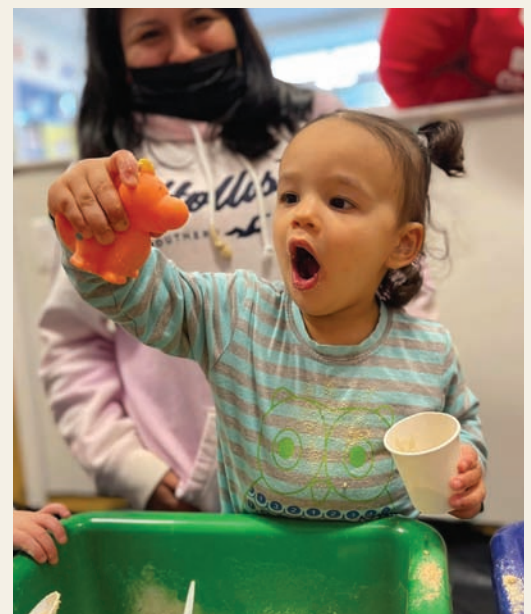
Discover more dinosaurs and smiles inside on page 6.