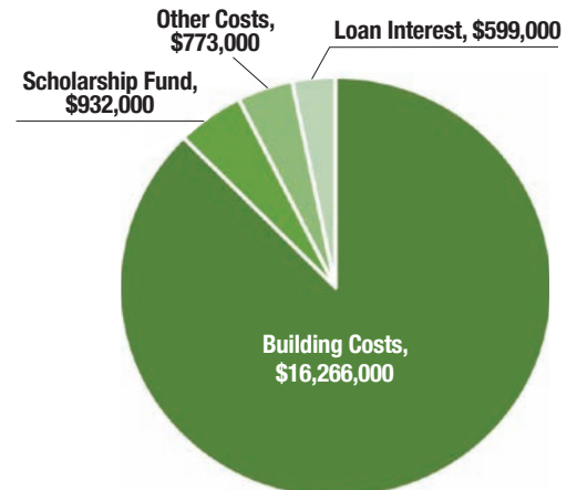
Use of Funds (Total Cost: $18.57M)