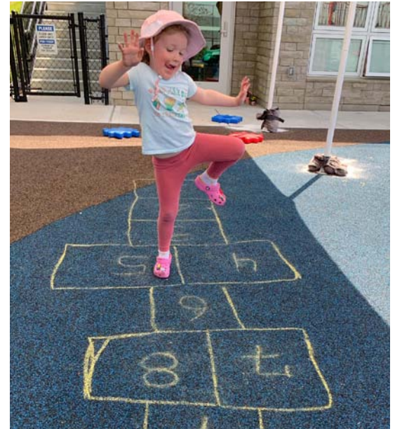
OCC's building and playgrounds may be brand new, but some classic games never really get old.