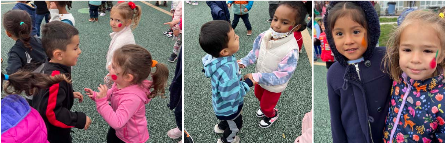
Everybody Dance Now! The OHS Band inspires everyone to move to the music.

Our annual Fall Festival is back after a two-year interruption due to COVID precautions. This beloved tradition at OCC features the Ossining High School (OHS) Marching Band.