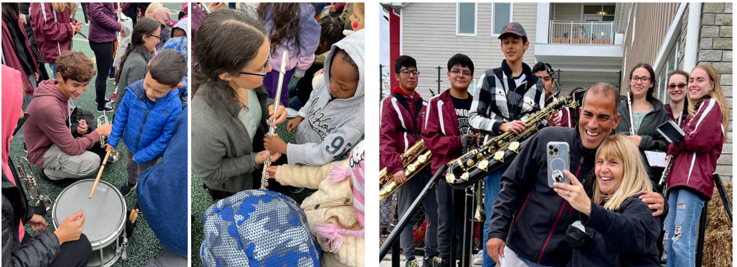
Meet the Instruments: Members of the OHS Band give our youngsters an introduction to their instruments.