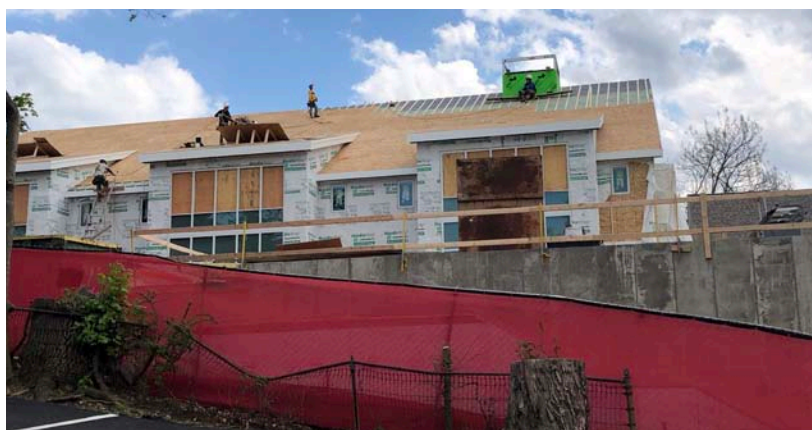
Installing the roof, May 15, 2020

Construction on OCC's new facility at 32 State Street started about a year ago. Despite challenges of weather and an abbreviated COVID-19 shutdown, thanks to a State waiver, the new Rebecca and Arthur Samberg Building is slated to open on schedule this fall. The 27,000 square foot facility will house all of OCC's programs at one location, and allow us to expand our enrollment from our current 150 to more than 200.