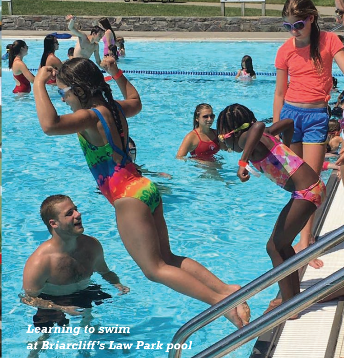
Learning to swim at Briarcliff's Law Park pool