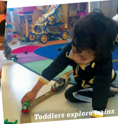
Toddlers explore trains

incorporated many new experiences promoting learning: from having infants wash their own toys with sponges or bubbles at the sensory table; to toddlers