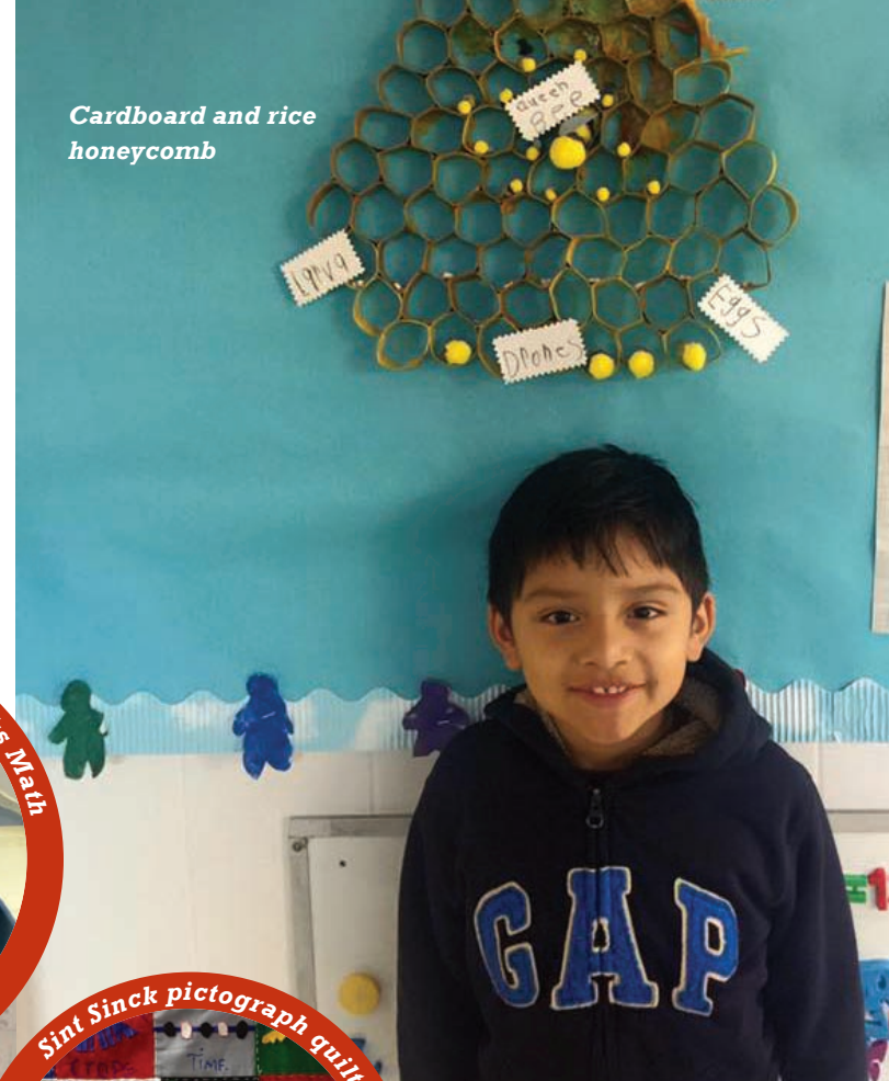
Cardboard and rice honeycomb

Consult your financial advisor about how you can take care of your heirs while also leaving a legacy to OCC. Our legal title is "Ossining Children's Center, Inc."