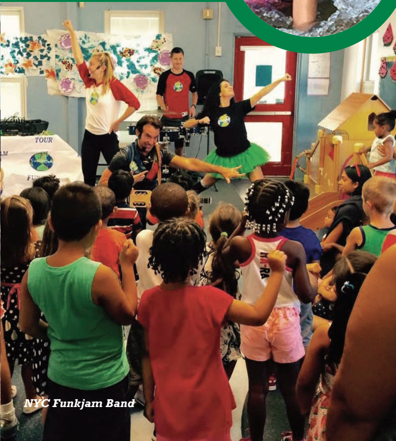
NYC Funkjam Band