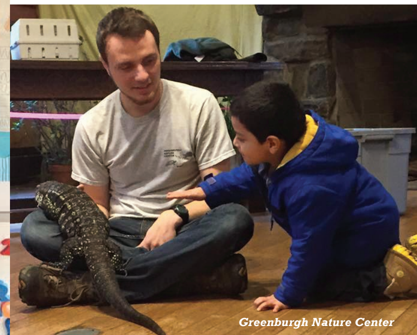
Greenburgh Nature Center

The Kindergarten class has had a variety of new learning experiences. They spent an intensive three weeks studying the life cycle, hive structure and social hierarchy of the honeybee. The children then made a larger-than-life bee comb out of cardboard tubes with rice representing the eggs. Also, for the first time, our Kindergarten class used seeds rather than