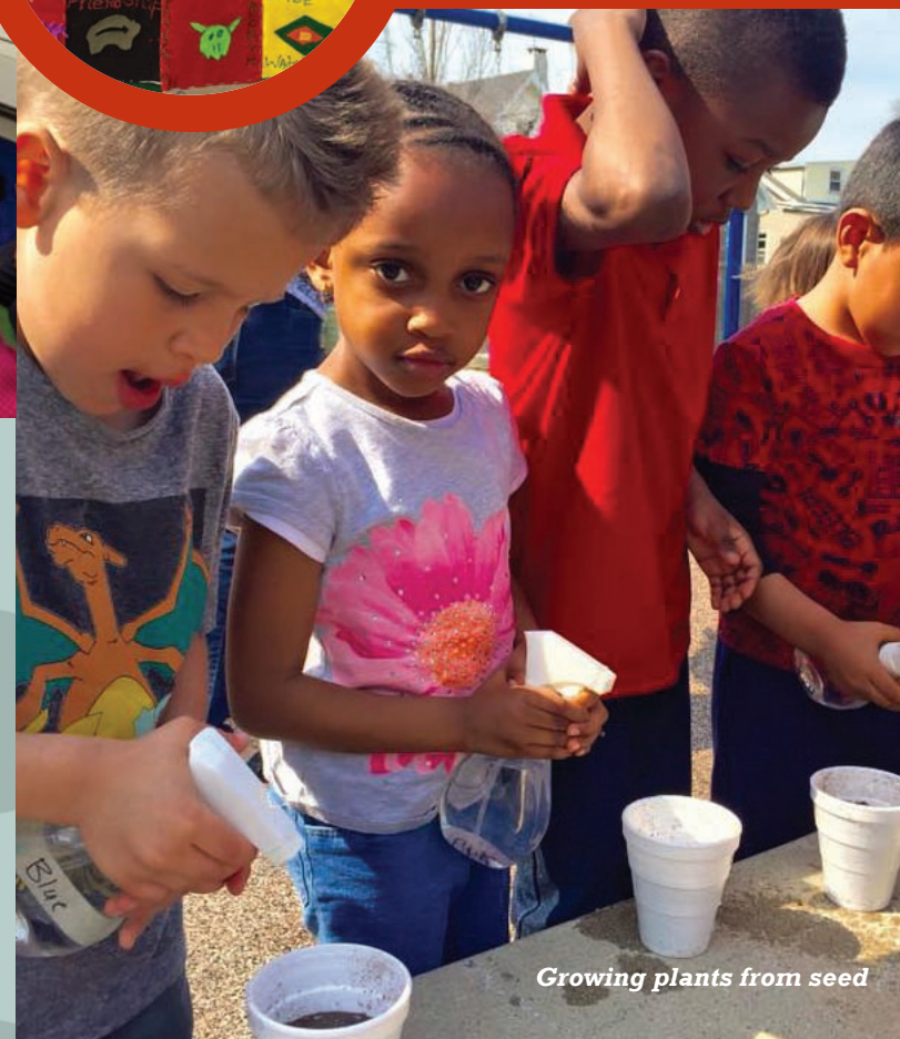
Growing plants from seed

seedling plants for our vegetable garden. After nursing the sprouts for several weeks, they transplanted them to the garden.