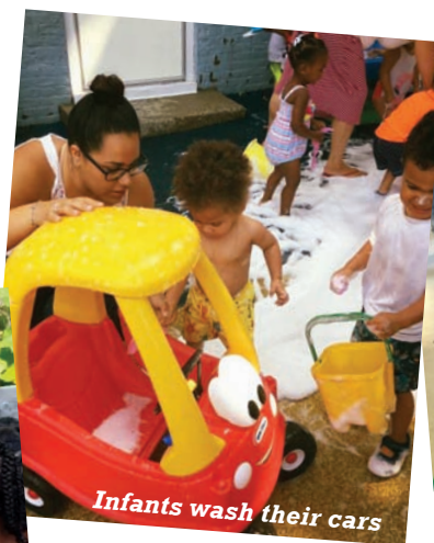
Infants wash their cars