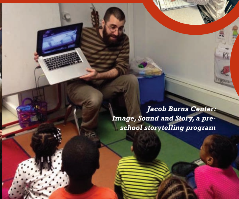
Jacob Burns Center: Image, Sound and Story, a pre-school storytelling program