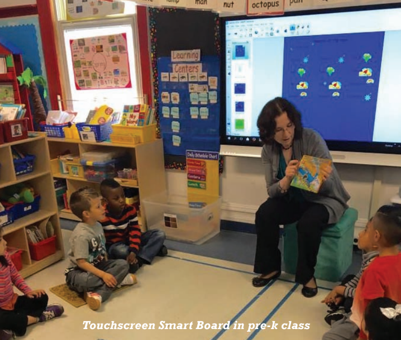
Touchscreen Smart Board in pre-k class

Our pre-kindergarten program has embraced the newest educational technology. We installed two state of the art touchscreen Smart Boards. These enable teachers to use computer-based lessons in calendar work, mathematics, social studies and pre-reading, etc. We also purchased additional iPads that our children can use for the new Building Blocks computer-based math curriculum.