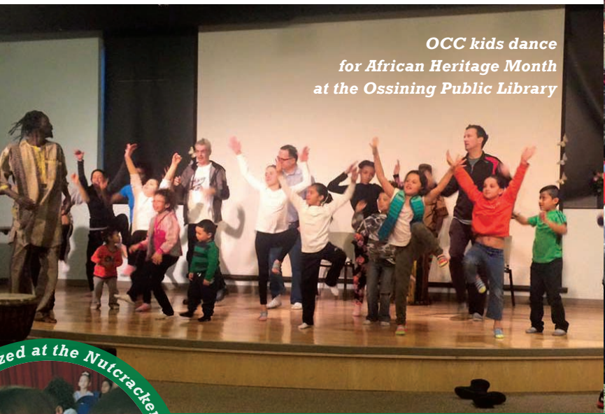
OCC kids dance for African Heritage Month at the Ossining Public Library

Opportunities for family involvement have also expanded in the past year. Through our community partnership with Neighbors Link, we hosted a 5-day, 15-hour Eco-Cleaning Training for individuals hoping to start or improve housecleaning businesses, including use of eco-safe products. Our parents also participated in Open Door’s food shopping experience, “Cooking Matters Grocery Store Tours.” Finally, our Parent Committee sponsored a first-ever Center-wide free family movie night including a pasta/pizza dinner.