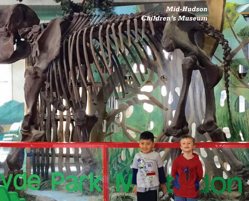
Mid-Hudson Children's Museum