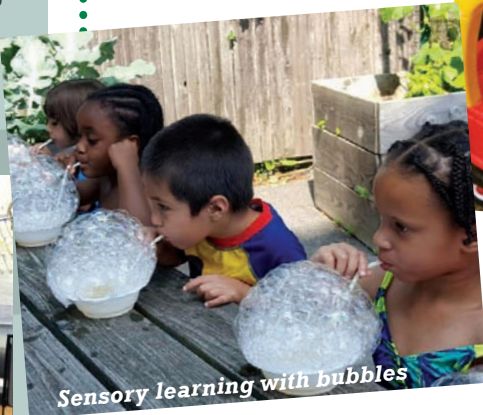
Sensory learning with bubbles

Our entire staff attended the New York State Association for the Education of Young Children Conference this year and we have