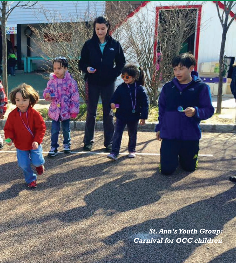
St. Ann's Youth Group: Carnival for OCC children

Our thanks to the parents who created and ran events that promoted a new level of family participation at the Center this year. And, our sincere gratitude to the many loyal donors, community members and agencies whose contributions and participation helped provide OCC’s services to working families.